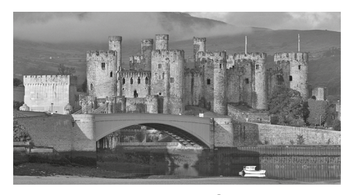
\cdot Conwy Castle \cdot